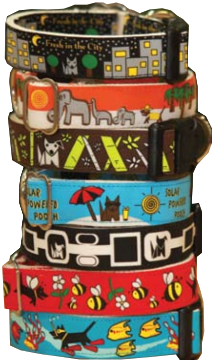
WAGGING GREEN'S BAMBOO COLLARS ARE NATURALLY ODOR RESISTANT, HYPOALLERGENIC, AND ABSORBENT FOR THE COMFORT OF YOUR PET. THEY ARE 100% BIODEGRADABLE AND SUPPORT EARTH FRIENDLY CAUSES! WWW.WAGGINGGREEN.COM.